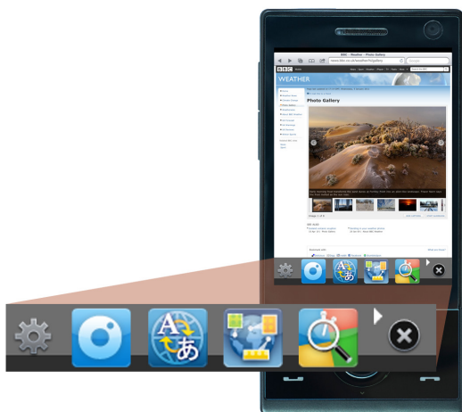
Figure 1: Amplicity's floating toolbar delivers personalized content and services.

Unlike traditional app stores where a small percentage of apps dominate 95% of purchases, Amplicity's personalization and recommendation capabilities can unite long-tail content with the niche audiences that want it, creating more opportunities for revenue generation in previously untapped markets.