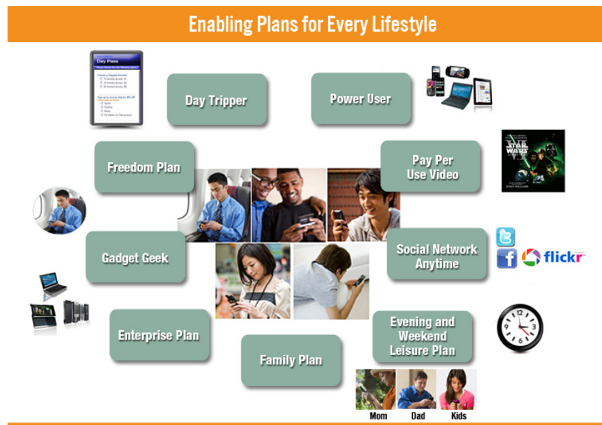
Figure 2: Passport enables service providers to offer service plans that are flexible and meet the needs of all subscribers.

For more information, please contact sales@openwave.com or visit www.openwave.com .